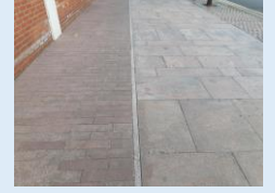
Image of pin kerb located around TQ campus