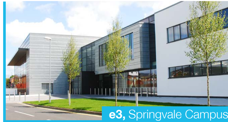
e3, Springvale Campus

All rooms have natural daylight, air conditioning and audio-visual facilities. The Titanic Quarter Campus is an ideal solution for organisation looking for an inspirational venue.