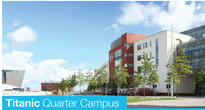
Titanic Quarter Campus

Whether you require a breakfast meeting, working lunch or fine dining, Belfast Met offers a broad range of menus to suit all budgets and tastes. All produce is sourced from the finest local suppliers, ensuring special dietary needs or allergies are always accommodated.